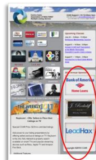
EXAMPLE 2 JOLT weekly e-newsletter: logo feature ads + links*