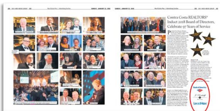
EXAMPLE 3 Advertising: Logo included in print ads in 2019.